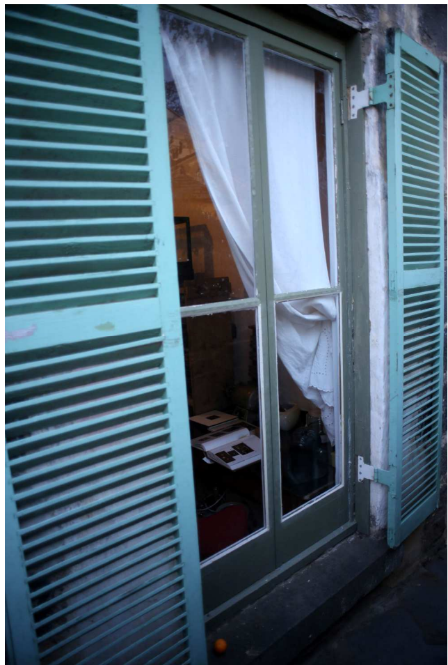
Front image & this page: Kerry Cross